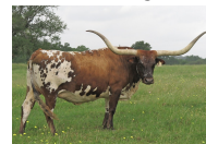
MI TIERRA CAPTIN HOOK