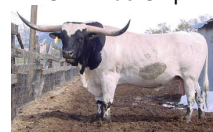
BREW PISTOL PACKIN MAMA